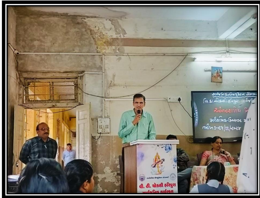
(આંતરજાતીય નિબંધ લેખન સ્પર્ધા)