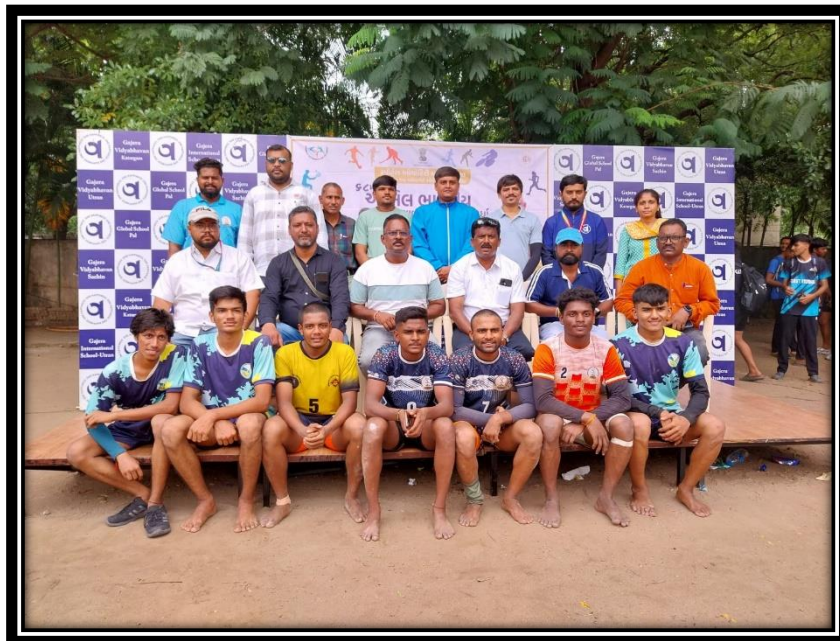
(SGFI DISTRICT LEVEL KABADDI 1ST RANK U19 BOYS)