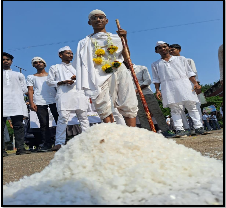
(GANDHI JAYANTI CELEBRATION)