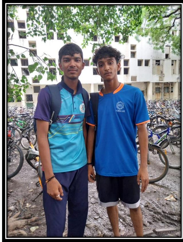
(SGFI KHO KHO U19 BOYS STATE LEVEL SELECTION)