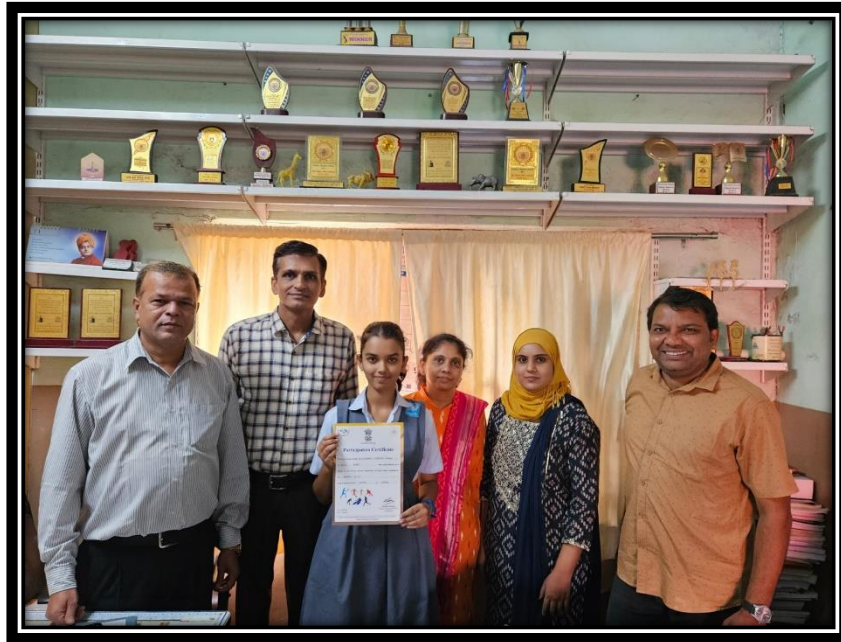
(SGFI Under 17 karate state level 2nd rank)