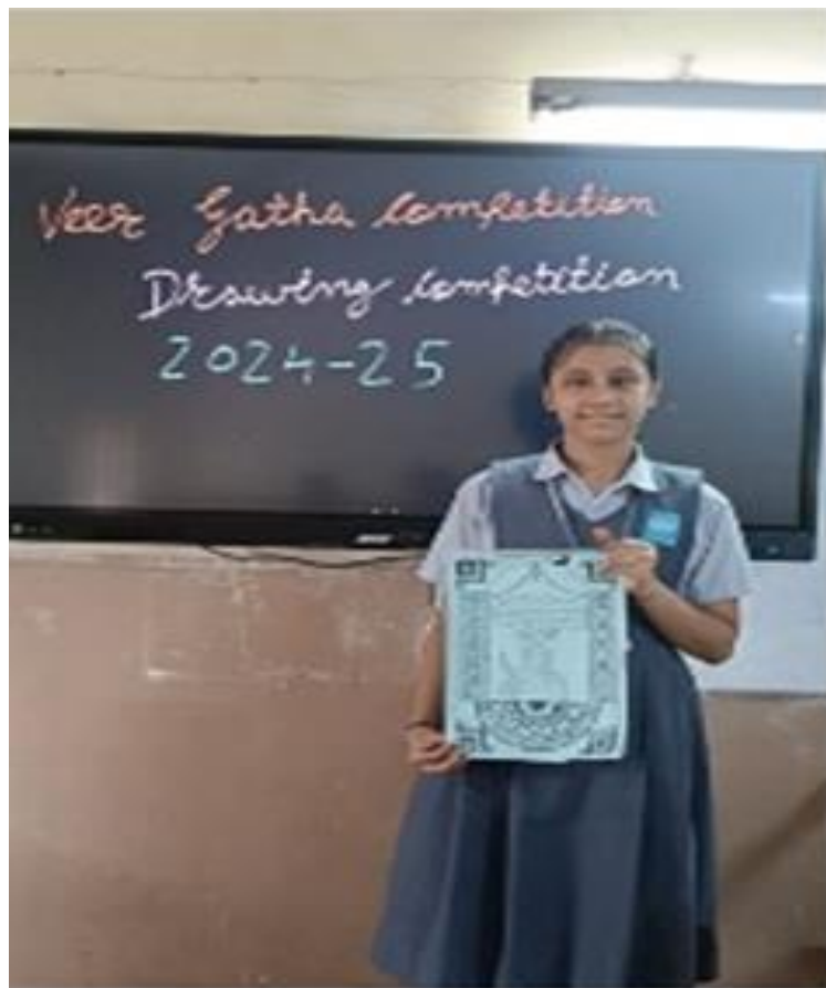
(VEER GATHA COMPETATION)