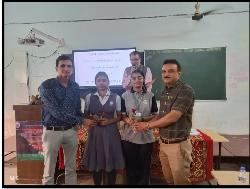
(आंतरशाळा वस्तुत्व स्पर्धा)