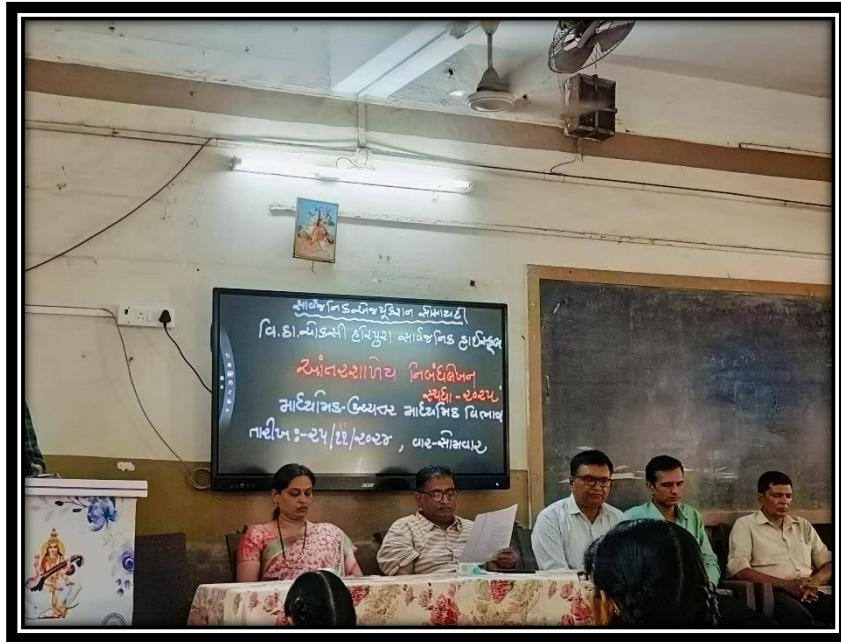
(આંતરરાષ્ટ્રીય નિબંધ લેખન સ્પર્ધા)