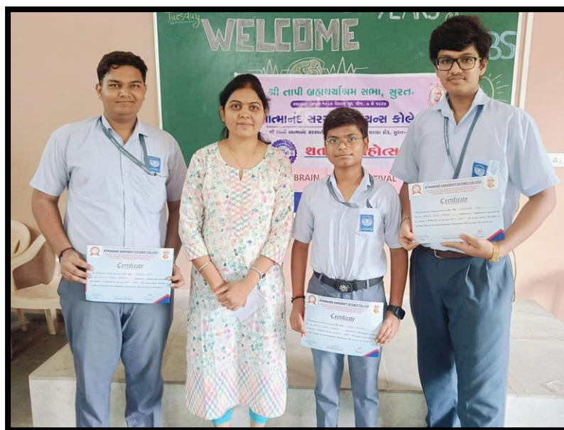
(BRAIN WAVE FESTIVAL)

→A project was exhibited during the science fair, representing our institution's focus on innovation.